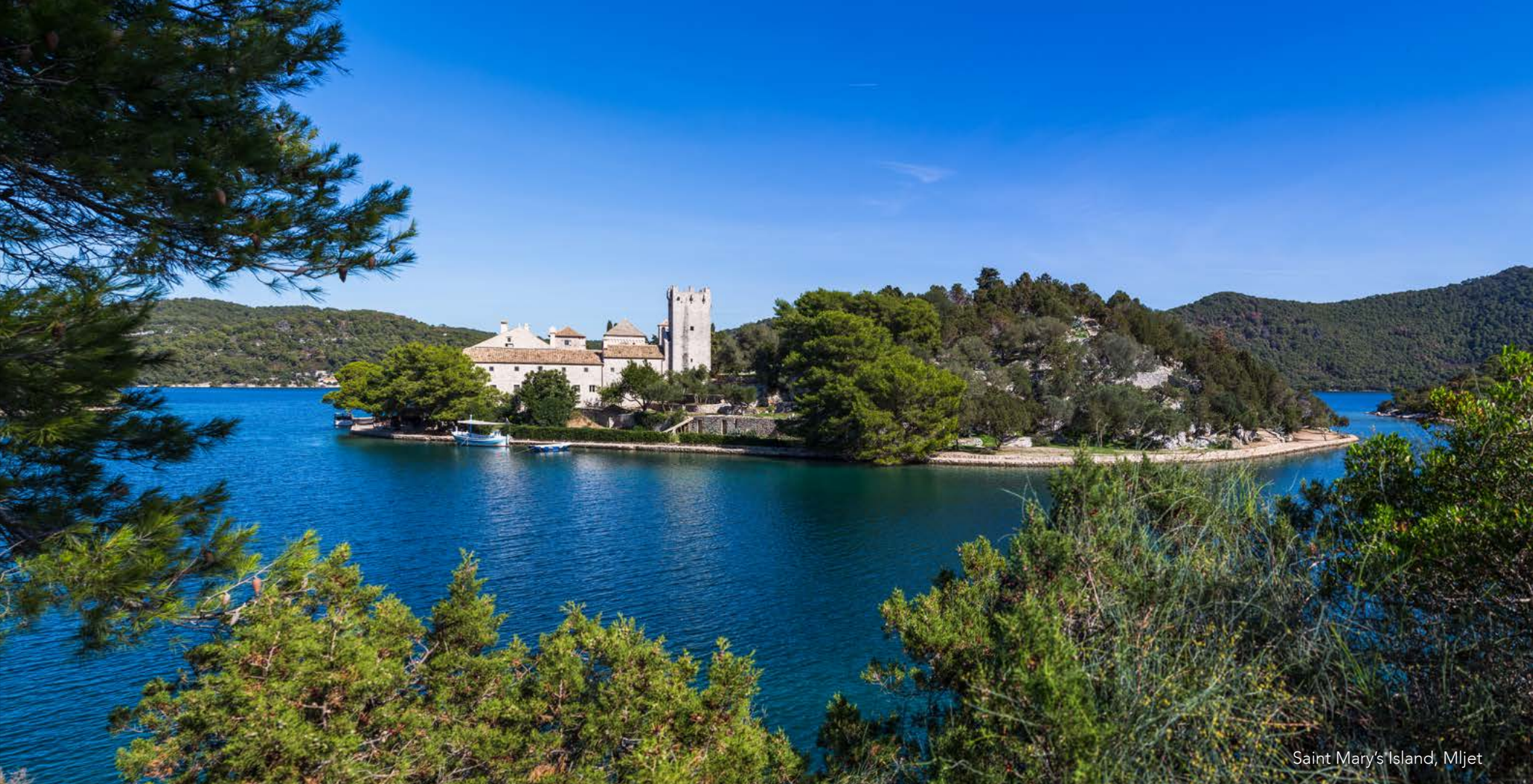
Saint Mary's Island, Mljet