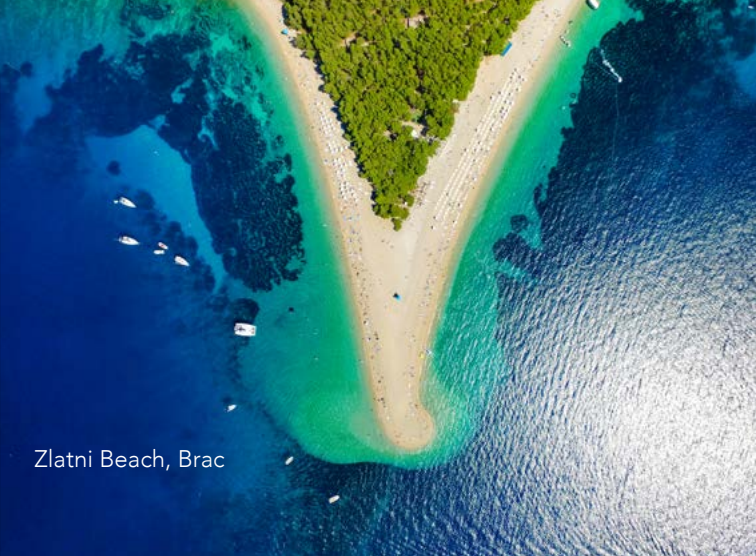
Zlatni Beach, Brac