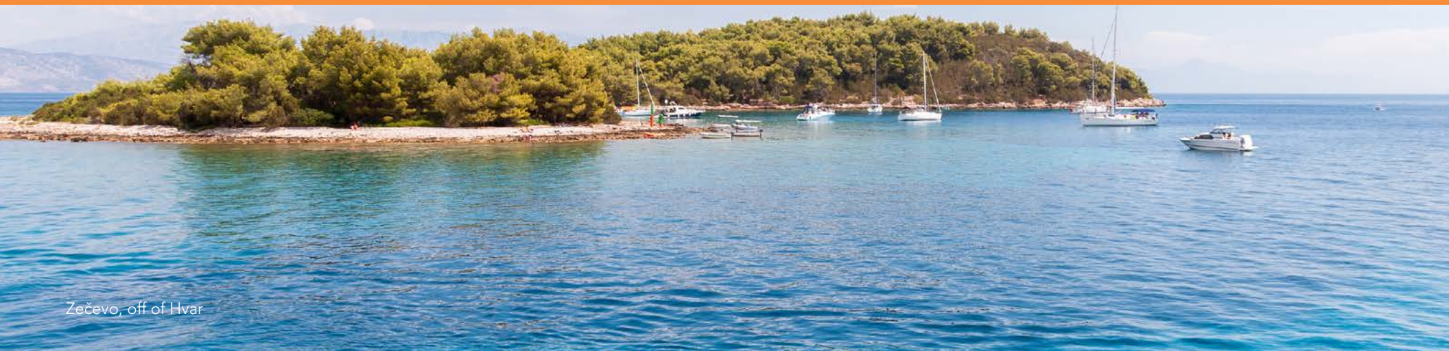
Zečevo, off of Hvar