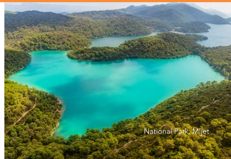
National Park, Mljet

A favorite destination, Mljet boasts its National Park surrounding the saltwater lakes, Malo Malo Jezero and Veliko Jezero. You can stroll along the lakes on paths shaded by pine trees, bicycle through the park, rent a kayak to paddle the lakes or simply swim the clear, blue water.