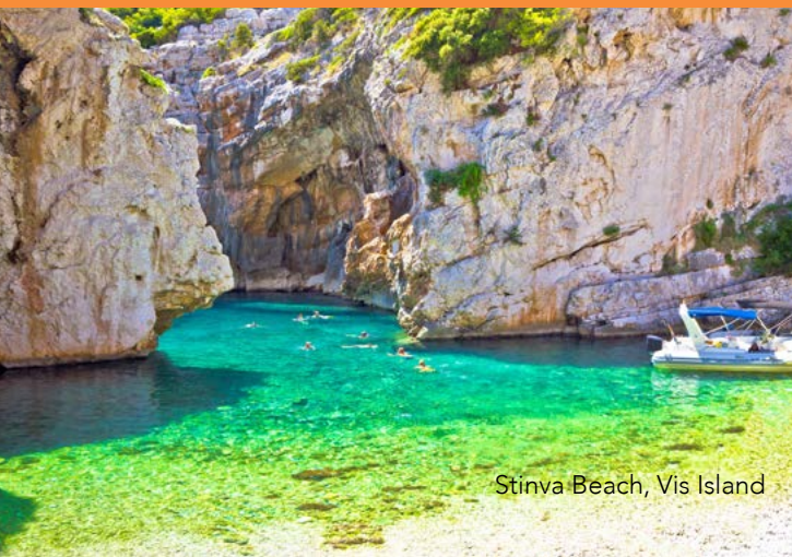
Stinva Beach, Vis Island